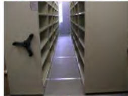
New mobile shelving installed