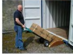
Moving the contents of the library into storage