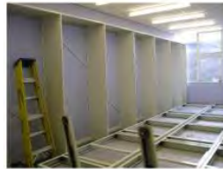
Getting the infrastructure in place