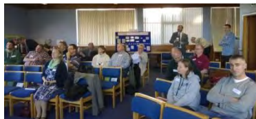
Photographs from previous Conference Days