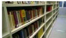
Starting to get the shelves filled again