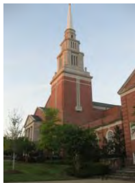
First Presbyterian Church, Jackson.