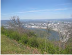
Chattanooga from Lookout Mountain