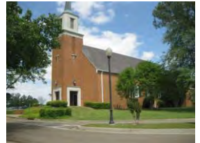
Chapel at RTS, Jackson.