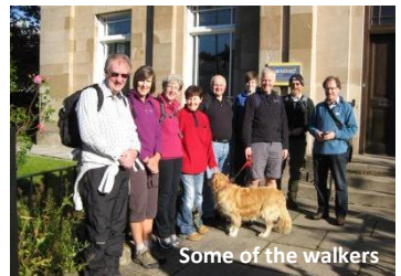
Some of the walkers

The day of the sponsored walk was beautiful and sunny. Starting at the College, a small but cheery group of walkers enjoyed the walk through Brahan Wood and up past Loch Ussie and Knockfarrel before heading back to Dingwall. They were even back before the start of the football in the afternoon!