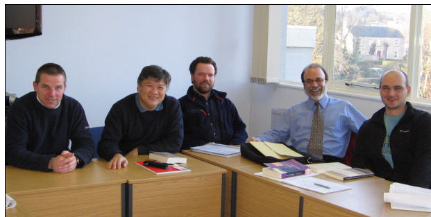
Photo: Some of the 2008/09 MTh Students